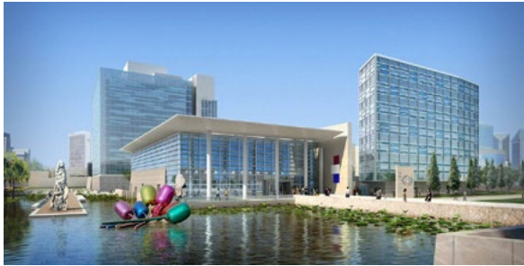
Skidmore, Owings and Merrill, LLP

Architect of Record Skidmore, Owings and Merrill, LLP