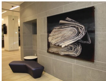
April May 2000, Shanghai No. 1 , by Xiaoze Xie