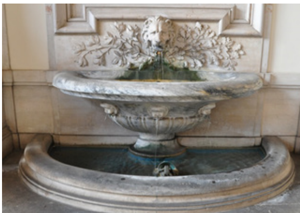
ORNATE FOUNTAIN ON THE WEST WALL OF THE FOYER