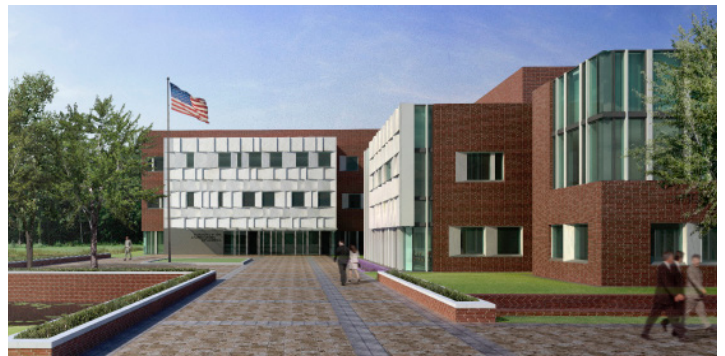
MOORE RUBLE YUDDALL ARCHITECTS & PLANNERS

emitting diode (LED) site lighting; electric traction elevators; and variable frequency drives from pumps, fans, and motors.